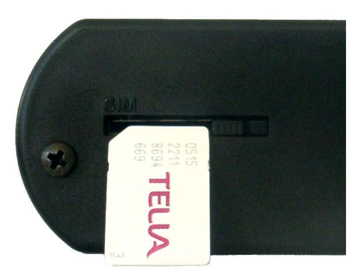
SIM card Orientation.

It is possible to detect the state of both the SIM Insert and SIM lock status from the VPL program. Please consult the RTCU-IDE online manual for more information.